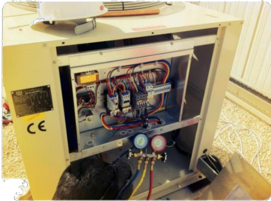
Dolphin Energy - Ras Laffan

Project Title: Design, Supply, Installation & Handing Over of Cold Store @ RAS LAFFAN