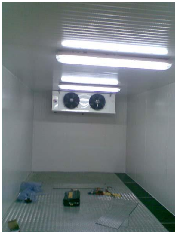
Figure 2 – Cold Store