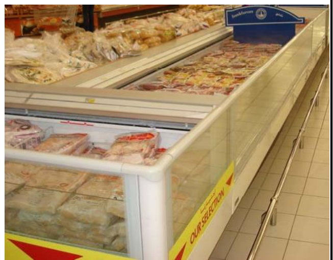
Figure 4- Display Chiller @ Carrefour