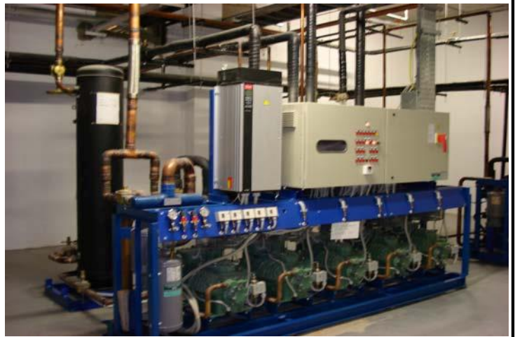
Figure 2 – Compressors Skid & Control Panel