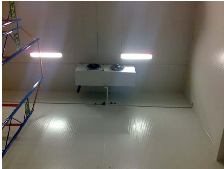
Figure 6- Evaporator @ 13 m height