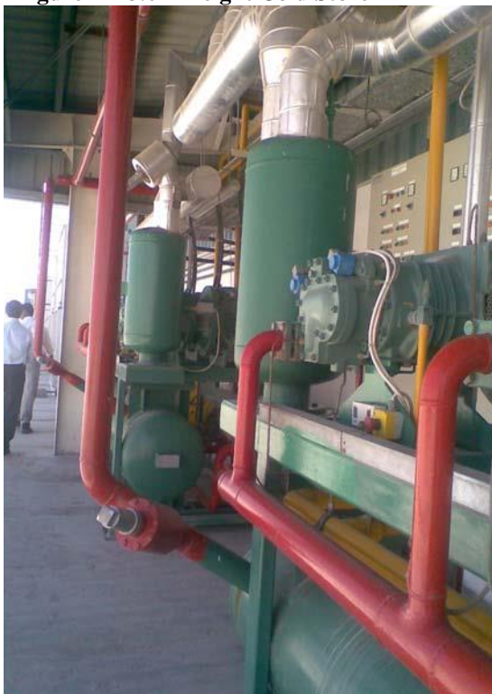
Figure 3- Bitzer Compressors Skid