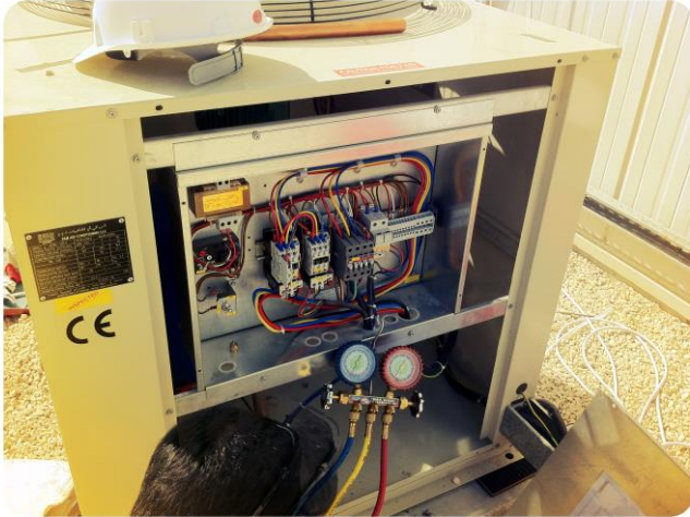
Dolphin Energy - Ras LaffanFeb

Project Title: Design, Supply, Installation & Handing Over of Cold Store @ RAS LAFFAN