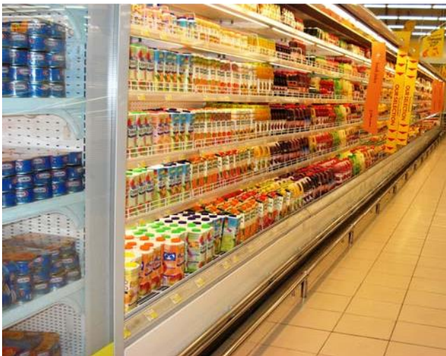
Figure 3 - Freezer Display @ Carrefour