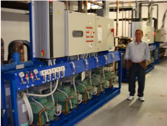
Figure 1 – Refrigeration Plant room @ Villagio Mall

Scope of Work: Complete Installation of the Cold Stores & Freezer/Chiller Cabinets