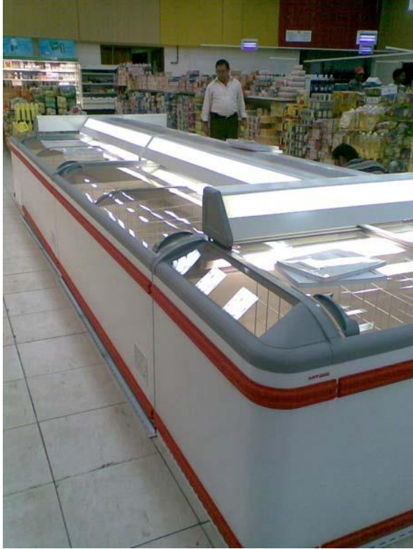
Figure 1 – Freezer Display Island @ AL MEERA

Scope of Work: Complete Supply & Installation of the Cold Stores & Freezer/Chiller Cabinets