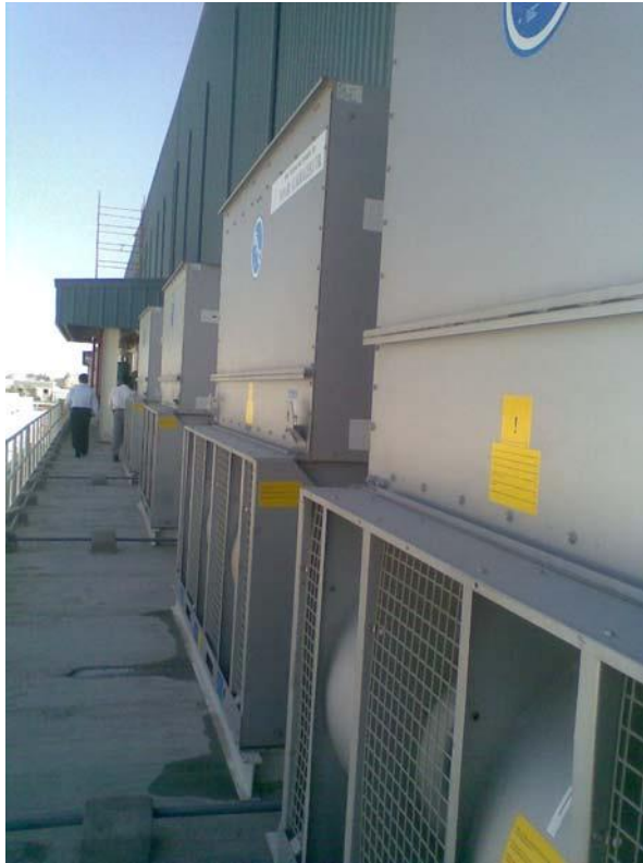
Figure 5-Evaporative Condensers