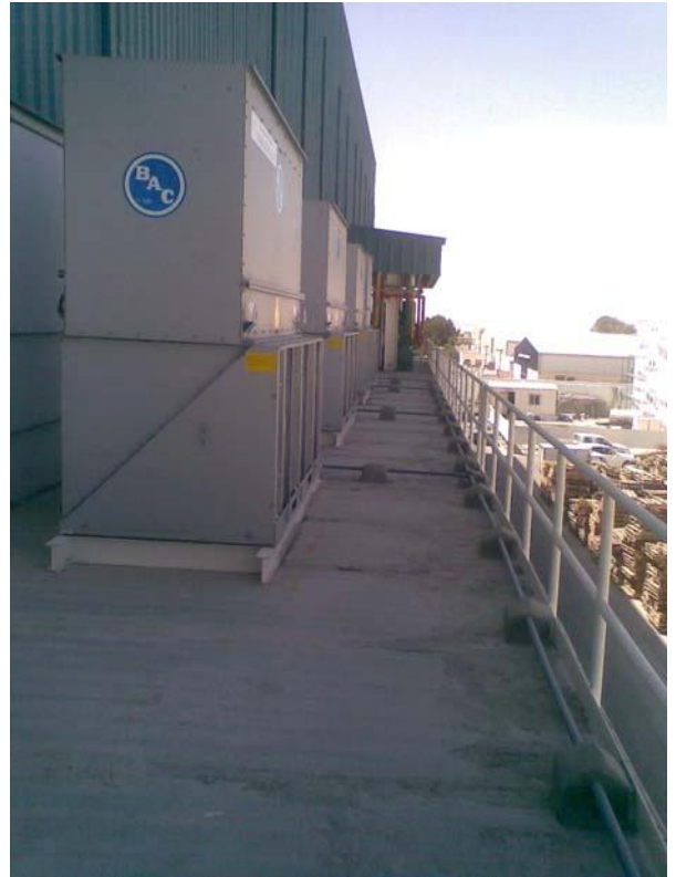
Figure 6- Evaporative Condensers