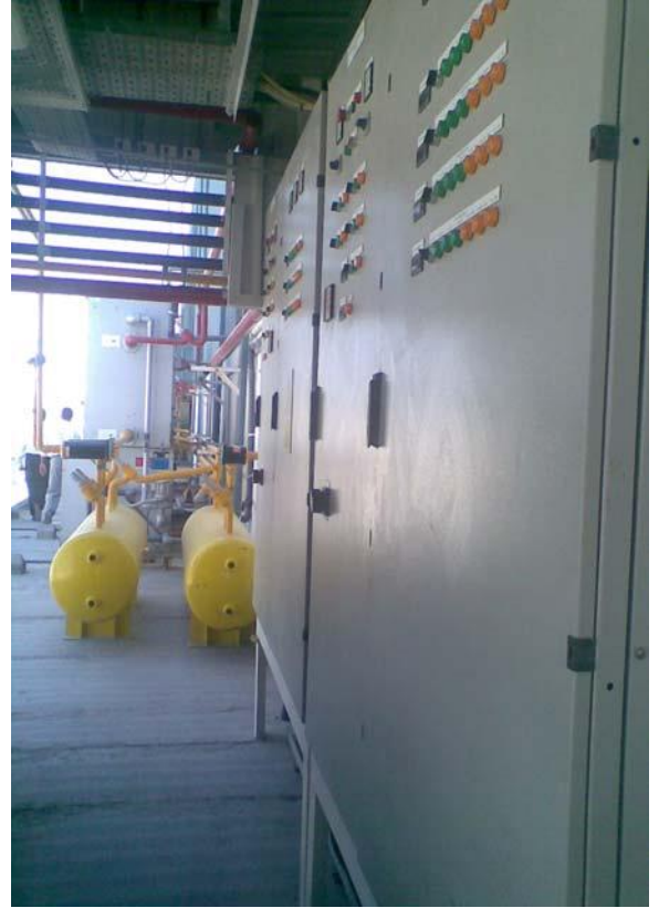
Figure 2- Control Panel