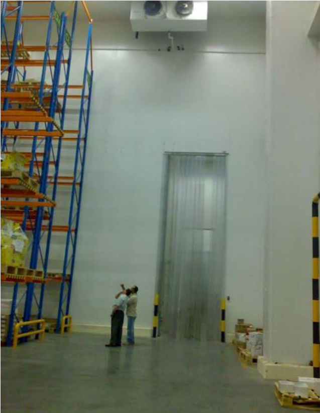
Figure 1- 13.6m Height Cold Store

Scope of Work: Complete Cold Store Design Supervision and Installation of the Cold Store Panels as well as Client's private consultant.