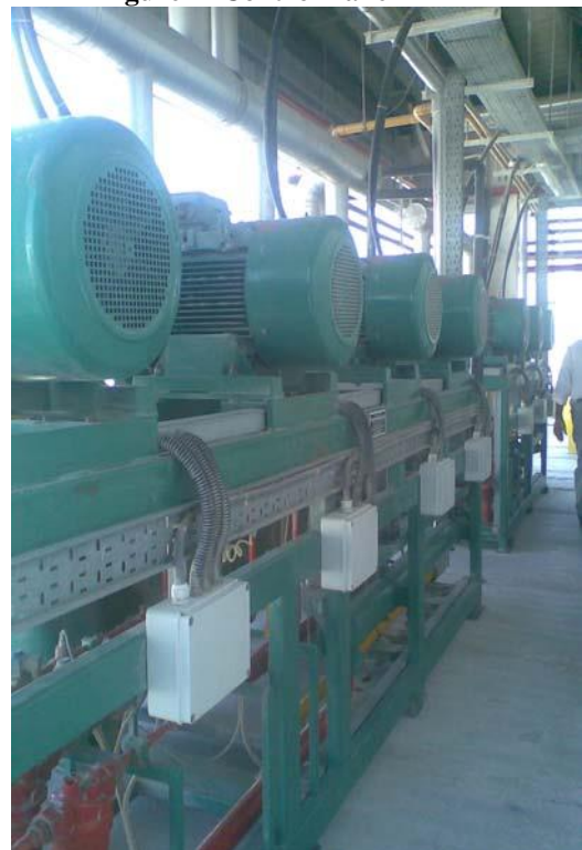
Figure 4- Industrial type compressor Skid